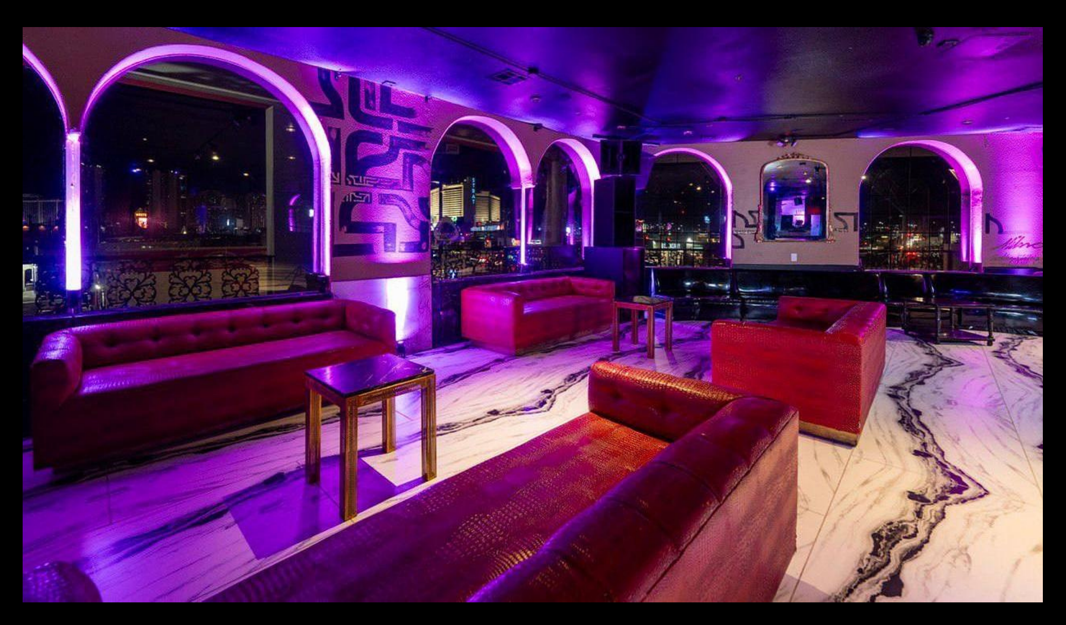
KEY2 LAS VEGAS LOUNGE NOW OPEN!